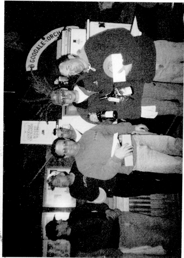
NEFA freaks at recent Frisbee Freaks Anonymous Meeting.

Golf Championship Series Standings, pages 14,15,19