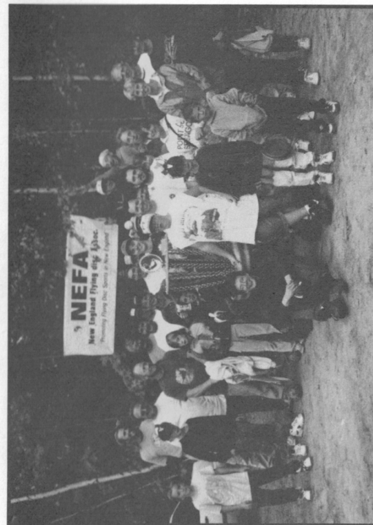
Participants at the Maine State Golf Championships held Sept. 9 at the Beaver Brook Campground, North Monmouth, ME.