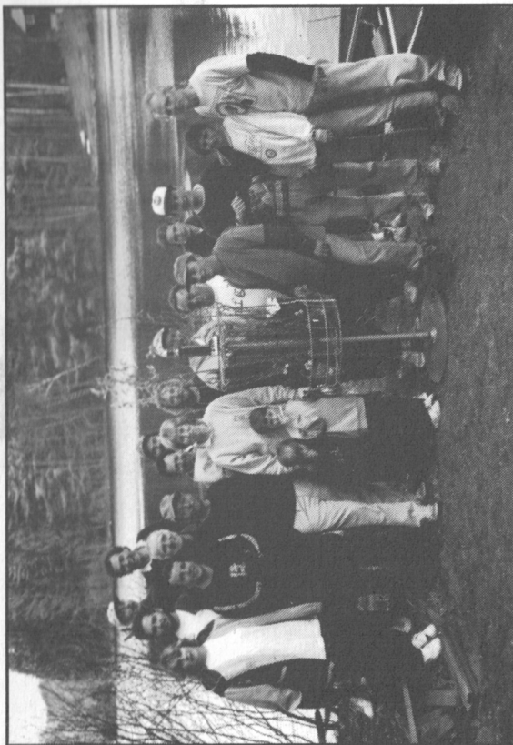
Participants at the Pulpit Rock Open held April 22 in Monson, MA.