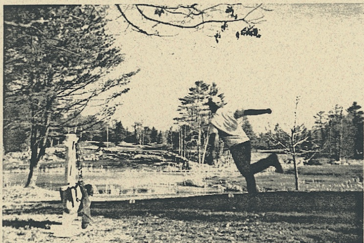
Local pro, Roy Doar, tees off over Hickory Pond

Disc golf (think Frisbee) is like regular golf with players "driving" (throwing) from tee pads and putting at targets called "pole-holes". These are metal contraptions with a basket and a ring of chains which are designed to catch discs. When the disc is in the basket, the hole is completed and the score is carded. Our 9 hole course winds through a mixed Cedar and Hickory forest and features raised tees, rock outcroppings, and a choice of playing from the Blue(shorter) or the White(longer) tee pads providing a challenge for beginners and veterans alike.