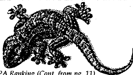
FPA Ranking (Cont. from pg. 11)