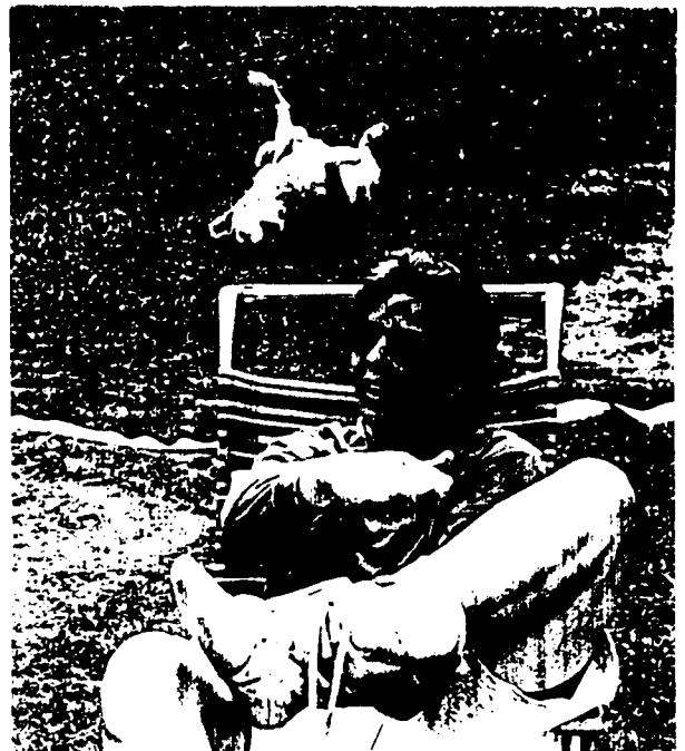
Tiina sez, "No, no, Sunny -- more anhyzer on that release!"