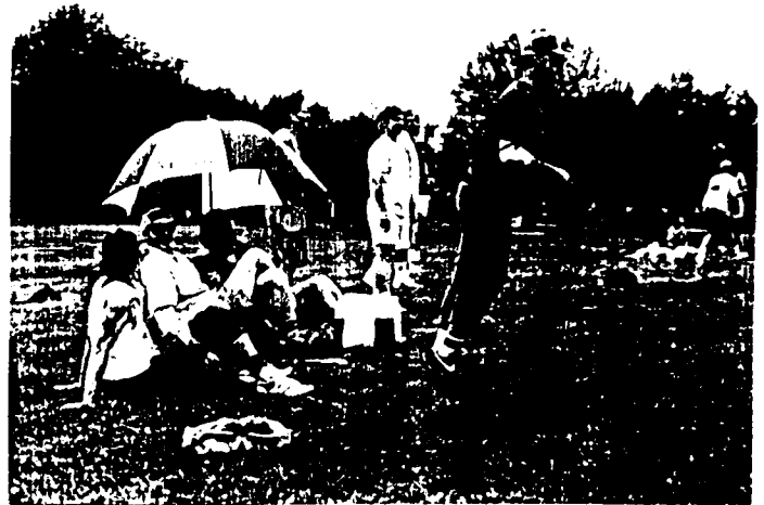
Sunny gets psyched to throw Grandmaster distance