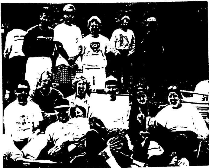
A herd of flying NEFAns at the World Seniors in Rochester, NY