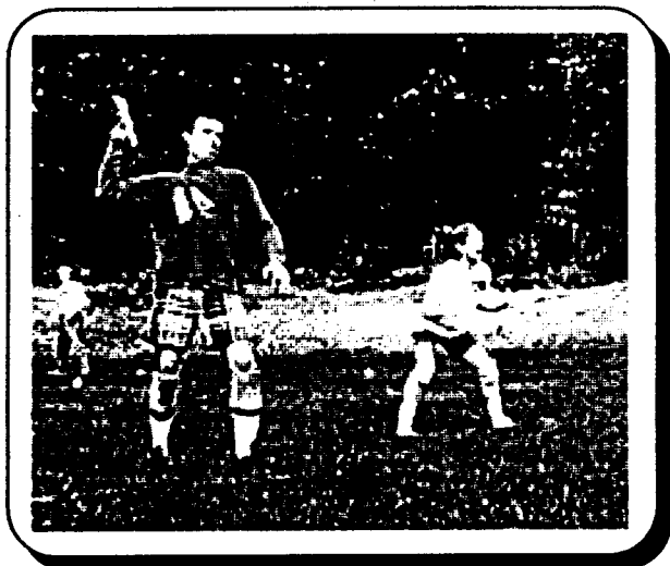
Normandy Farms: Black & Brodeur battle at New England's DDC